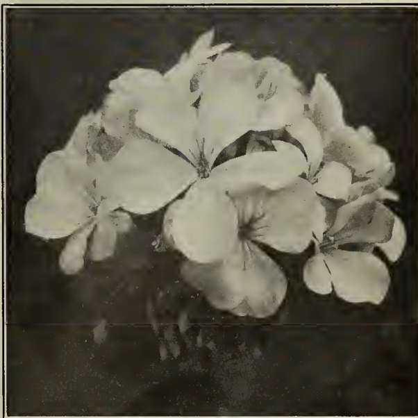
Feuer—See page 14

Carjan. (Brt. 1909.) Red color, large, white center. Chaverez Hermanos. (Brt.) Large, well-formed flowers of a bright vermilion shade. Docteur G. Chautaud. (Brt. 1909.) Rose-garnet color, with red margin on each petal; immense white center. Ernest Reyer. (Brt. 1909.) Immense, semi-double flowers of a light red color. Jacques Daurelle. Fine shade of bright, cochineal red. Jacques Jasmin. (Lem. 1909.) Flesh color, with pink shading; large, perfectly formed flowers. Regaine. (Brt. 1909.) White center upon a rose-cherry-cerise ground. Roseina. (Brt. 1909.) A fine rose color, two upper petals spotted white.